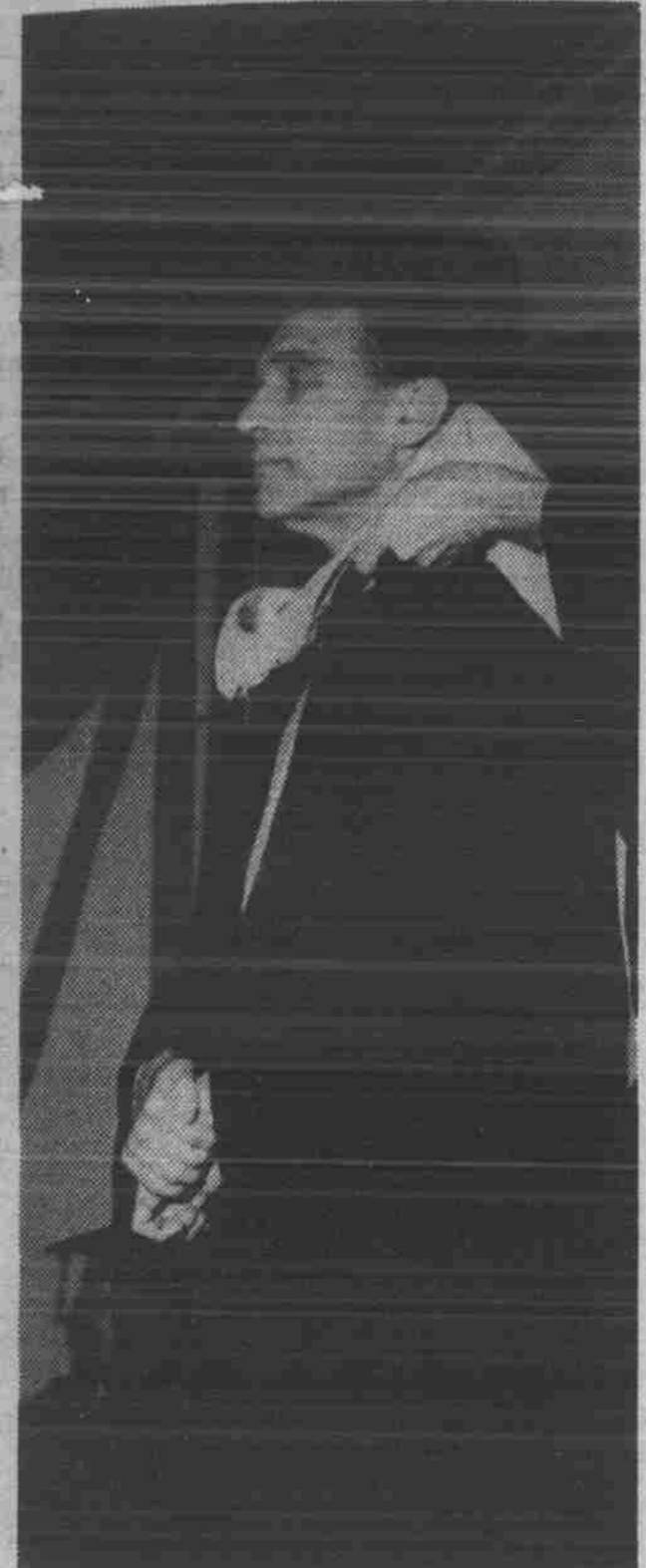
Coles is "hooded" . . . receiving honorary degree at graduation

Amid the turmoil in Northern Ireland, Coles will listen and watch and let a child tell the story. One small hope or fear communicated might touch someone much later through his writings. This is Coles' method. And so the connection—the human emotions and reactions we all share. Robert Coles reminds us of this.