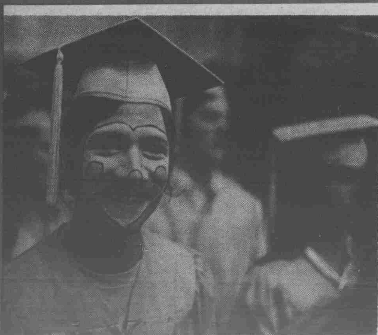
At commencement he's all heart

This spring he received a Guggenheim grant, the highest award for which an artist can hope, that will fund his efforts there.