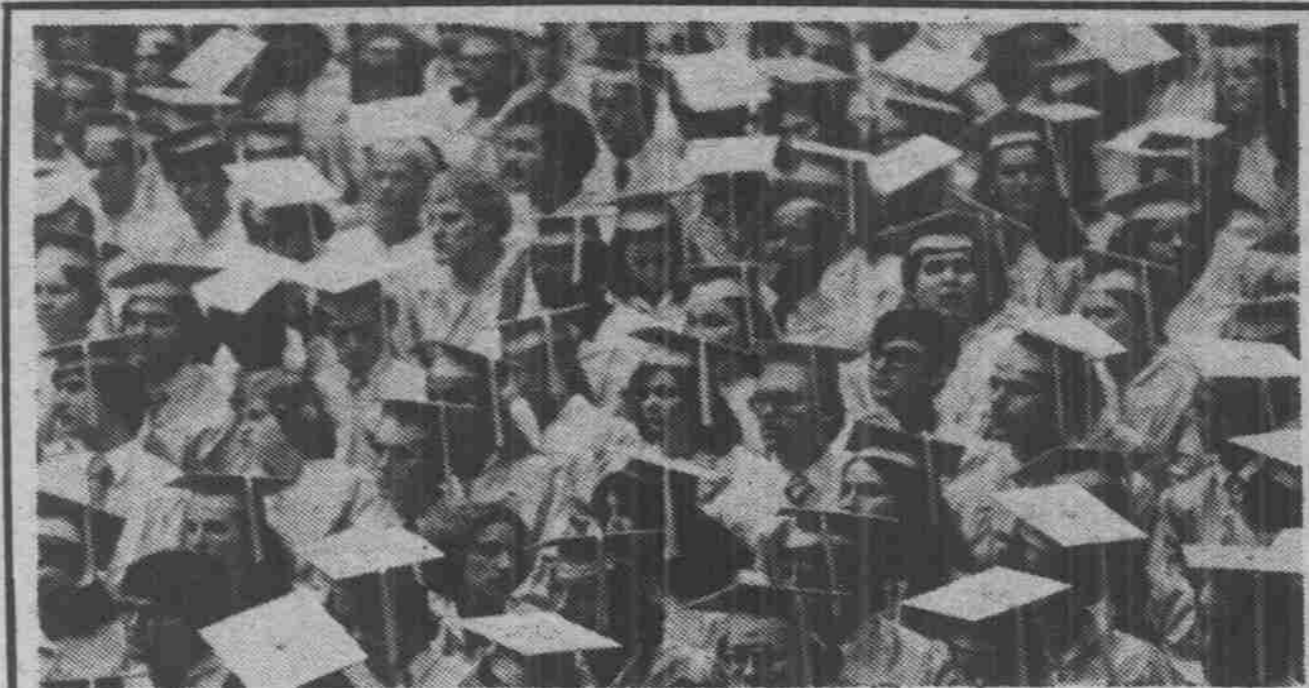
Carolina's newest alumni

"It will probably go out for a bid at the end of this month or early next month," he noted, adding that construction could begin before the opening of the fall session.