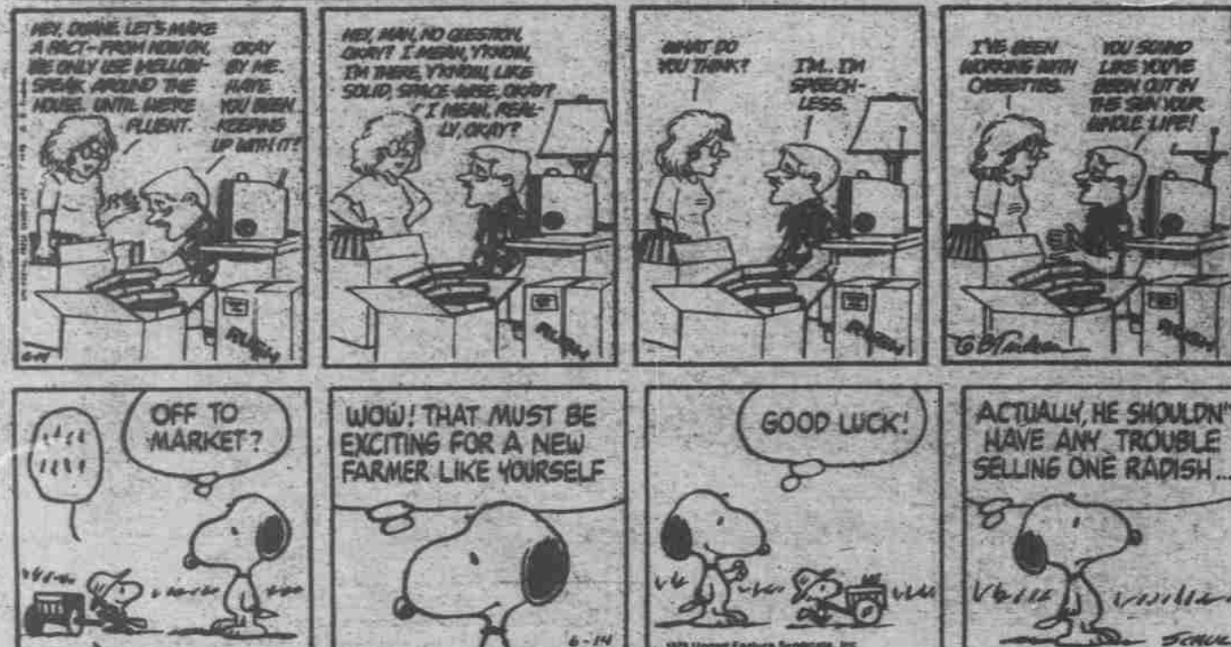
16 / The Summer Tar Heel / Thursday, June 14, 1979

Also River Runners' Emporium in Durham—383-2106