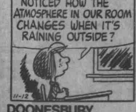
IN HERE, AND THE RAIN AND DARKNESS OUTSIDE THERE'S SORT OF A MEDIEVAL ATMOSPHERE