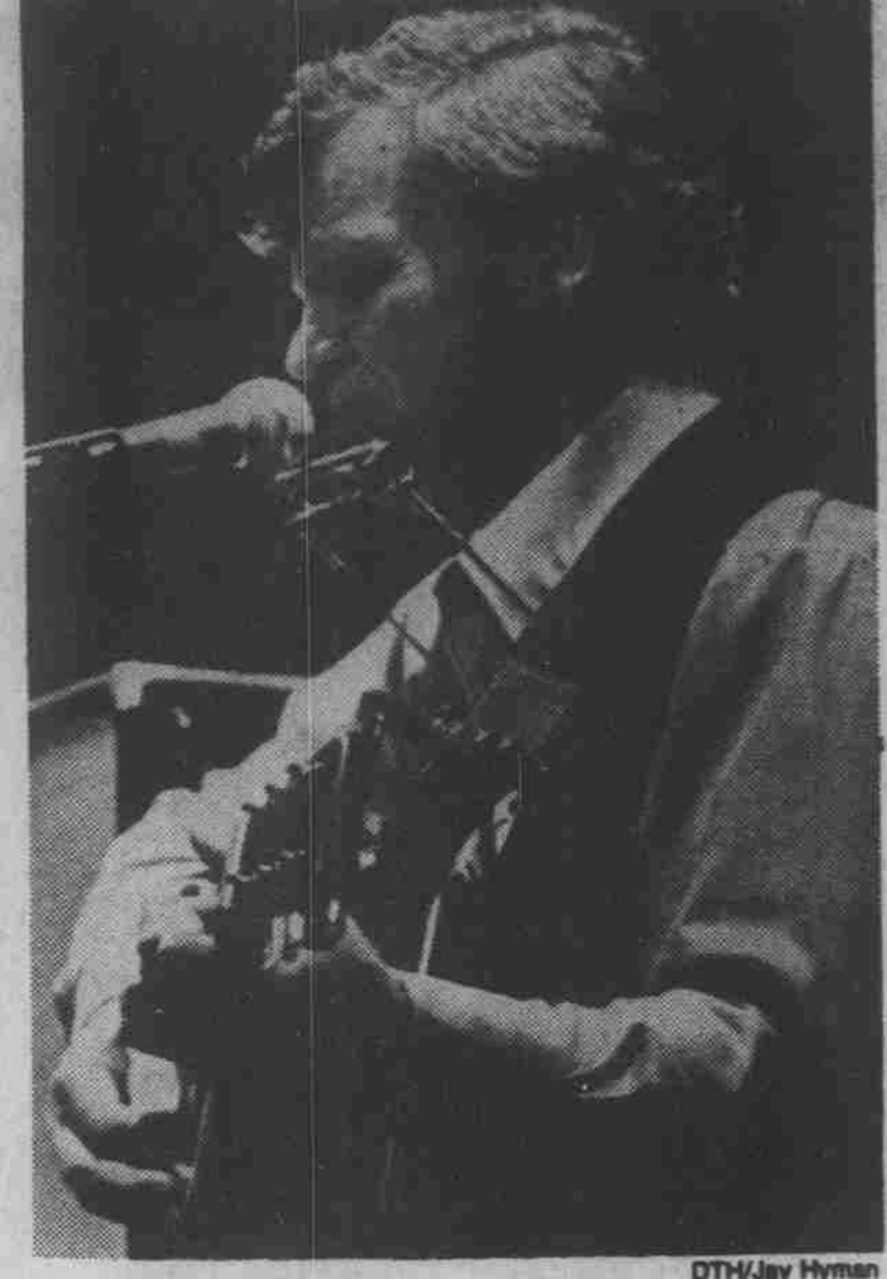
Doc Watson performing Saturday

the Union desk for the room number. Everyone is welcome