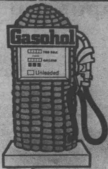
Gasohol available in area ...fuel is a corn product