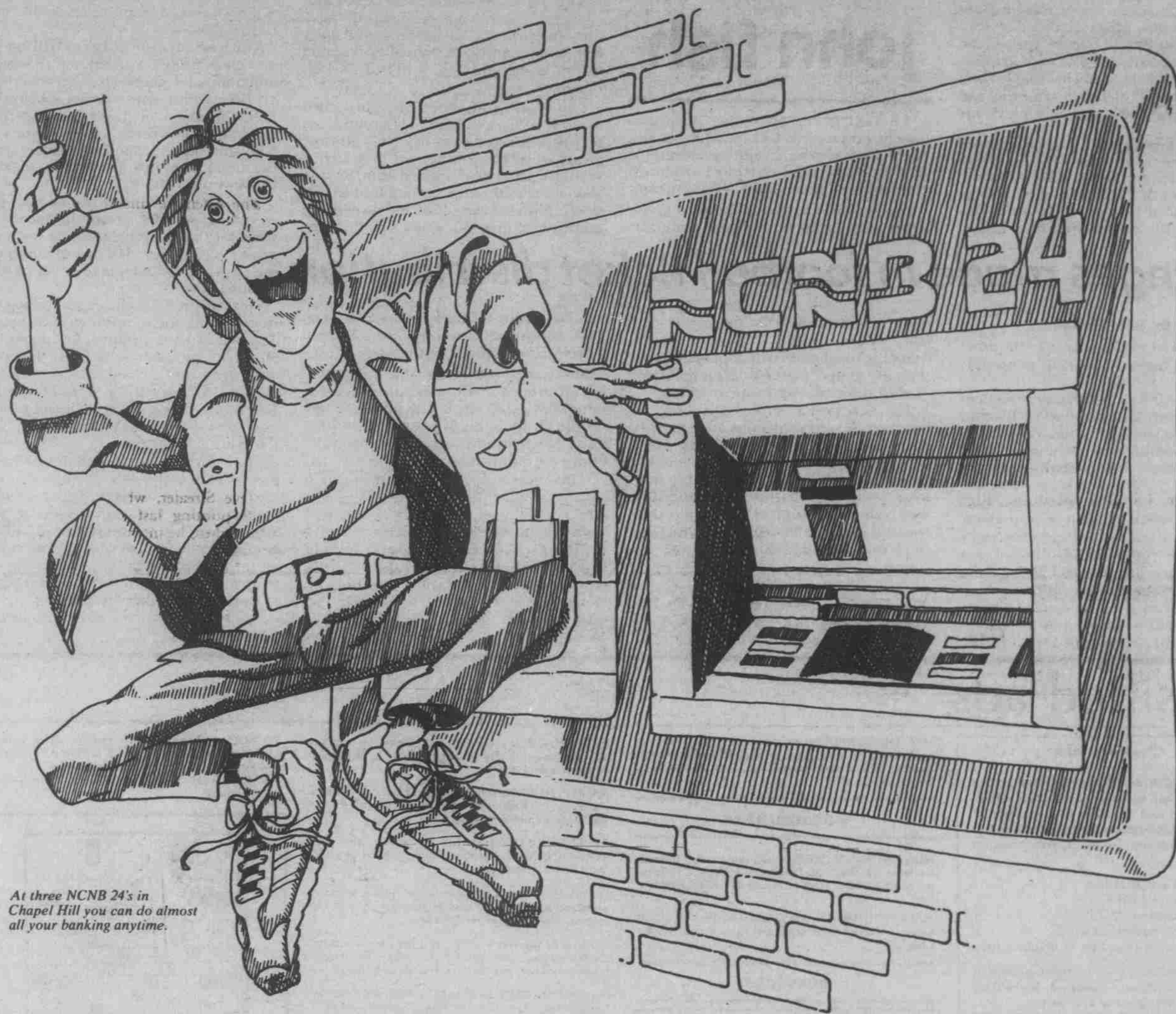
At three NCNB 24's in Chapel Hill you can do almost all your banking anytime.

Learning how to handle your money is one of the first lessons almost everybody gets at college. And it's not always easy. After all, when you're on campus, you've got plenty of other things to think about.