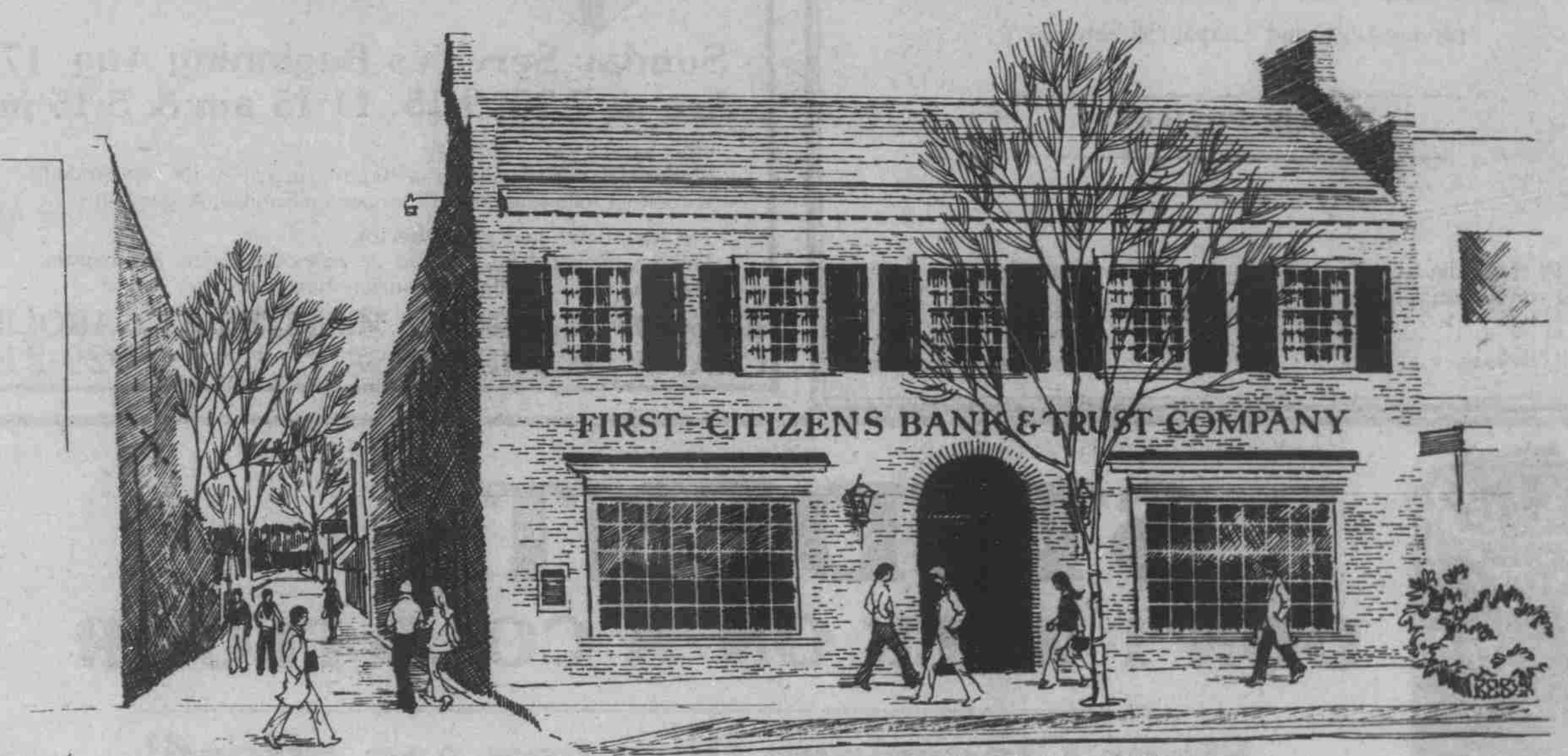
Our Downtown Office at 134 East Franklin Street is within walking distance of the campus.