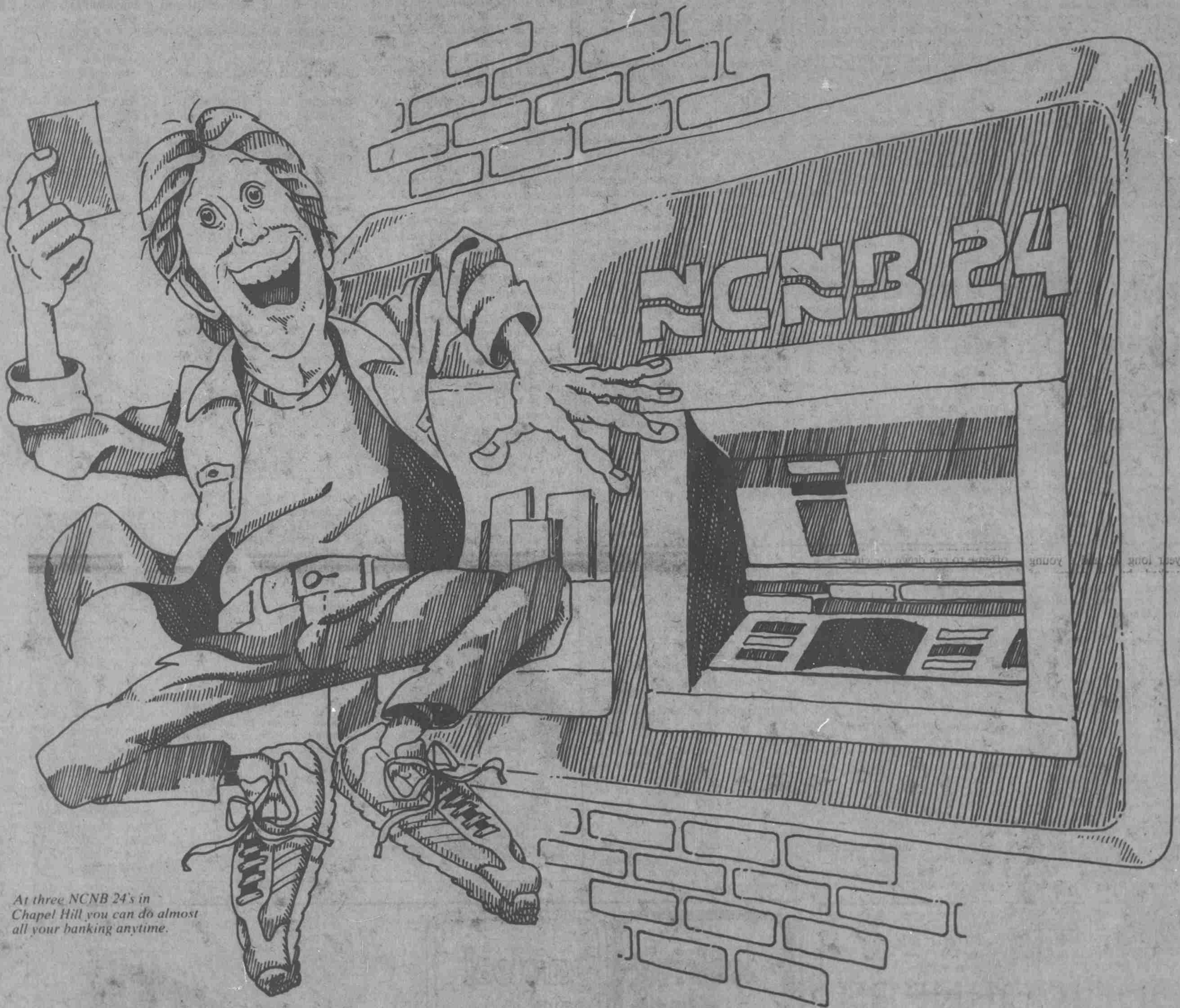
At three NCNB 24's in Chapel Hill you can do almost all your banking anytime.

Learning how to handle your money is one of the first lessons almost everybody gets at college. And it's not always easy. After all, when you're on campus, you've got plenty of other things to think about.