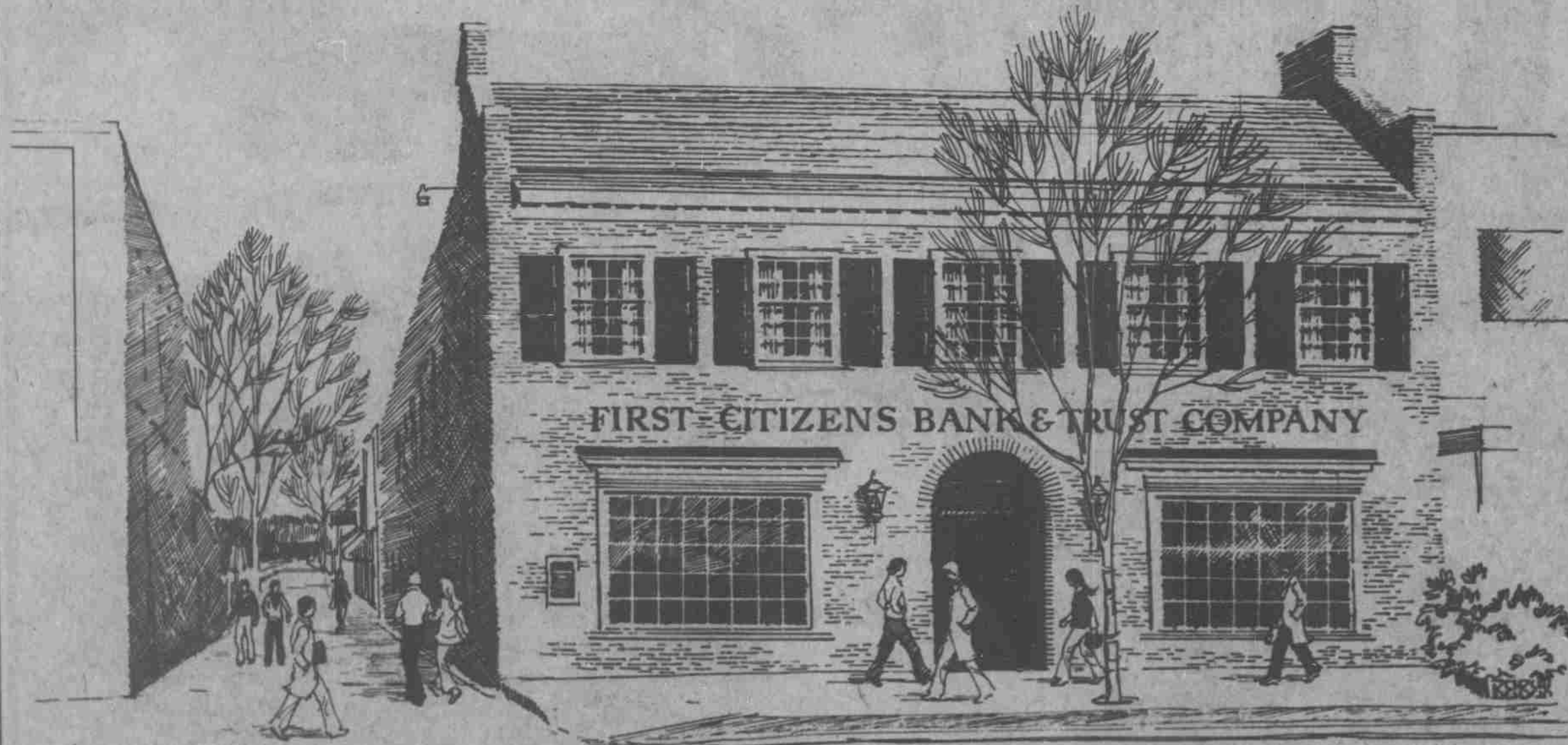
Our Downtown Office at 134 East Franklin Street is within walking distance of the campus.