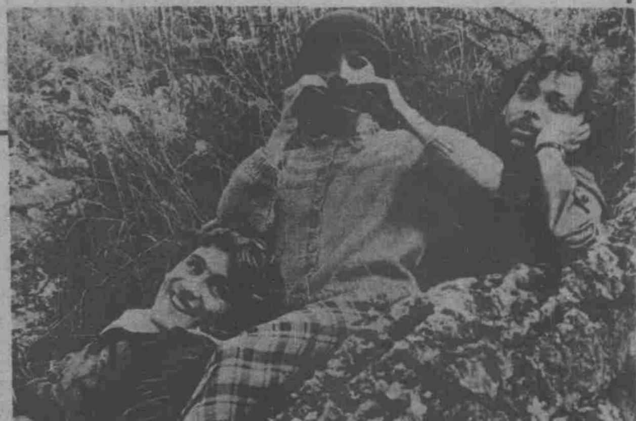
Gerard Depardieu, Patrick Dewaere and Carol Laure star in Bertrand Blier's 'Get Out Your Handkerchiefs,' part of Union Week activities.

Football , UNC vs. Furman at 1 p.m. Saturday in Kenan Stadium.