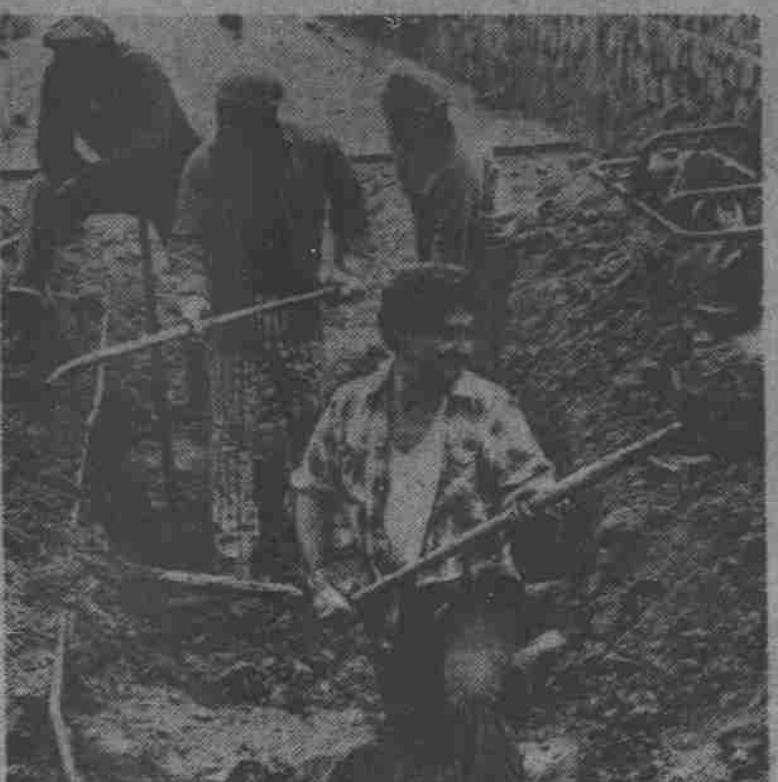
Workers repair leaky pipeline ... ground near libraries caved in

According to the engineering office, the centralized system is designed to cut down the diversity of temperatures between buildings. It also has some favorable cost advantages. Officials said there won't be any need to replace worn-out in-house refrigerator machines or put