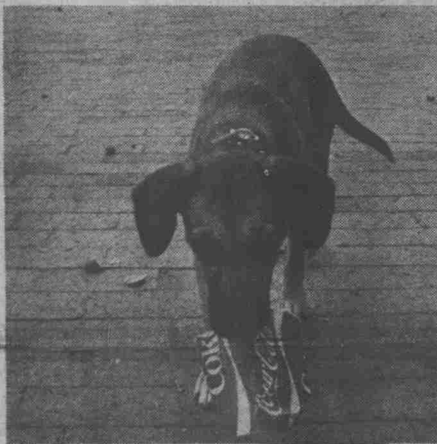
New food service patron ... leaves Fast Break