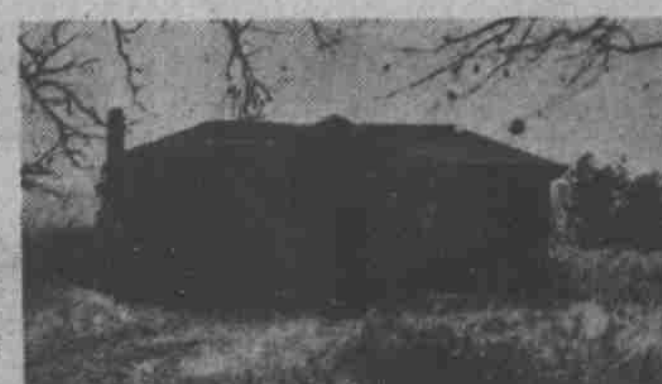
Recent White House renovations ... lead to AI-Nancy dispute

"He just can't see that I don't want mess hall gear on my dinner table, men in uniform around my dinner table, or my living room arranged to accentuate what he calls 'that oh so divine bunker look,'" Mrs. Reagan said. "We're just completely different. I