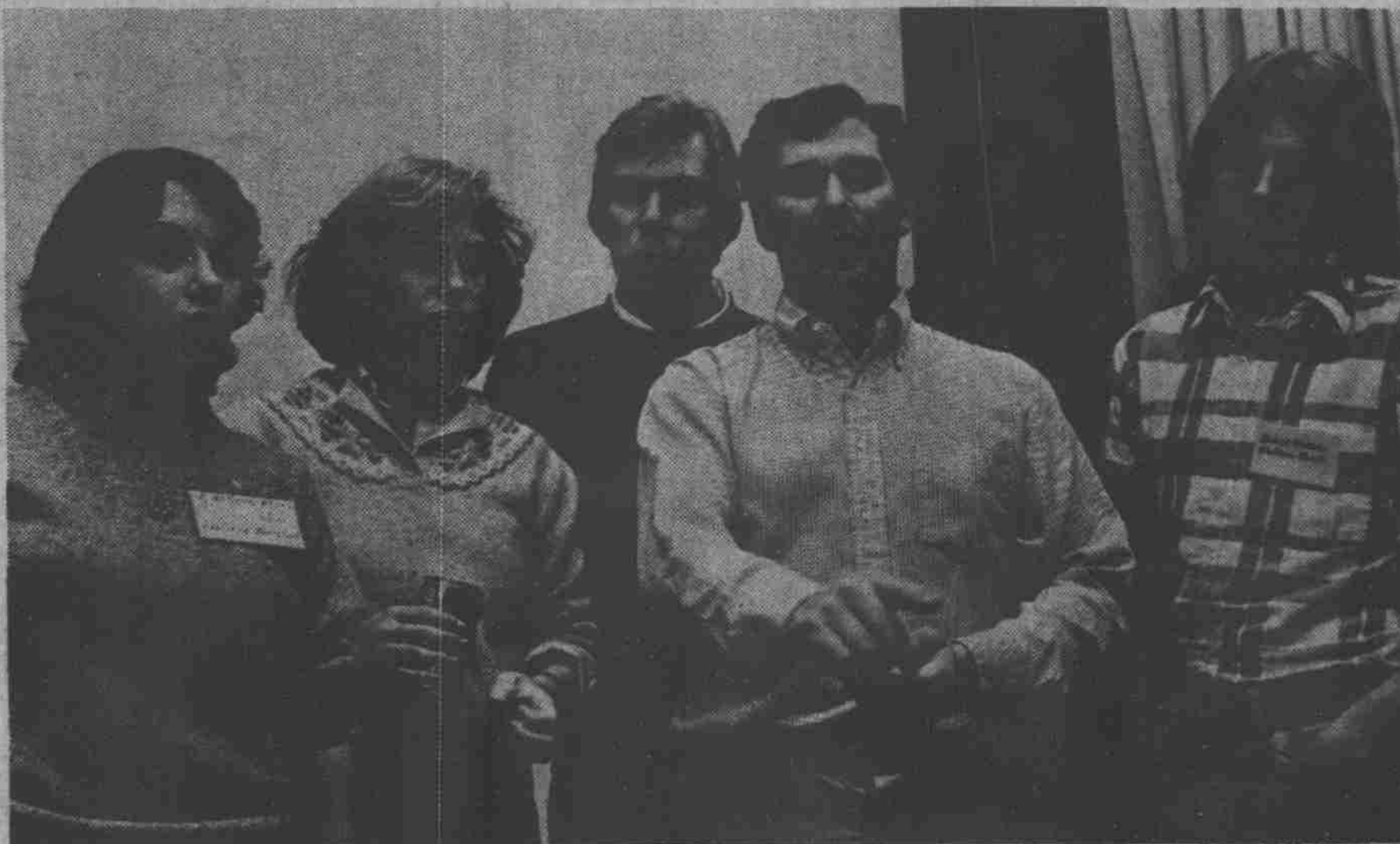
Elections Board members following Tuesday meeting ... 'What the heck, why not do it again?'

Another board member was quoted as saying, "All I want to know before we go through this thing again is 'What time do the polls close? Is it 6:15 p.m. or 7:00 p.m.?'"