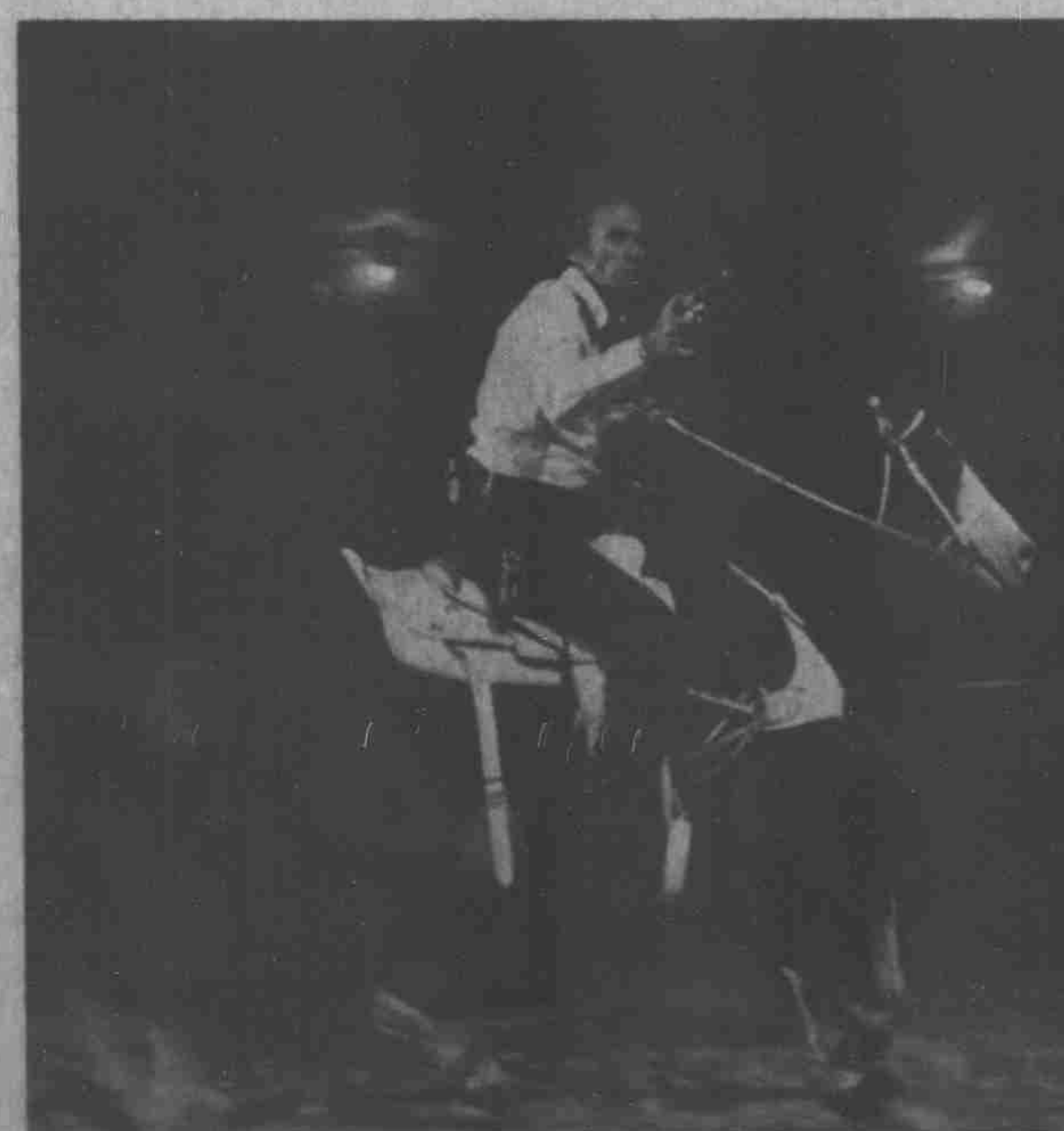
Clint Eastwood rides away as Bronco Billy ... takes unprecedented 7 Oscars