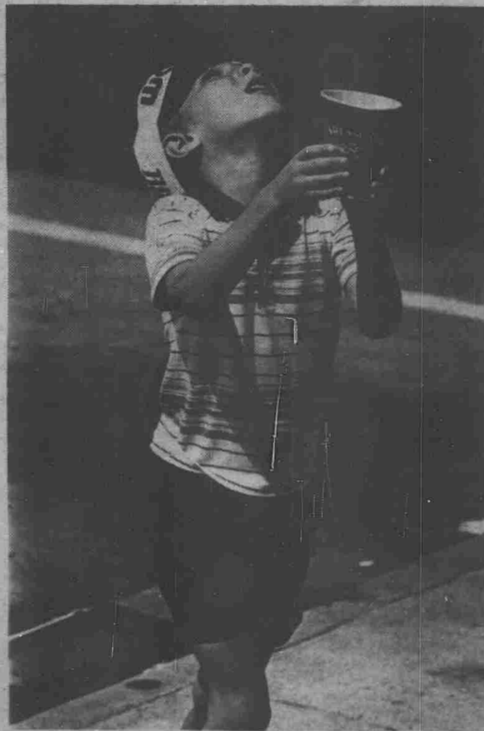
Chapel Hillians, young and old, enjoyed the Ice Cream Drop at University Square Sunday. Those who could not catch a scoop could taste a scoop. Everybody won.