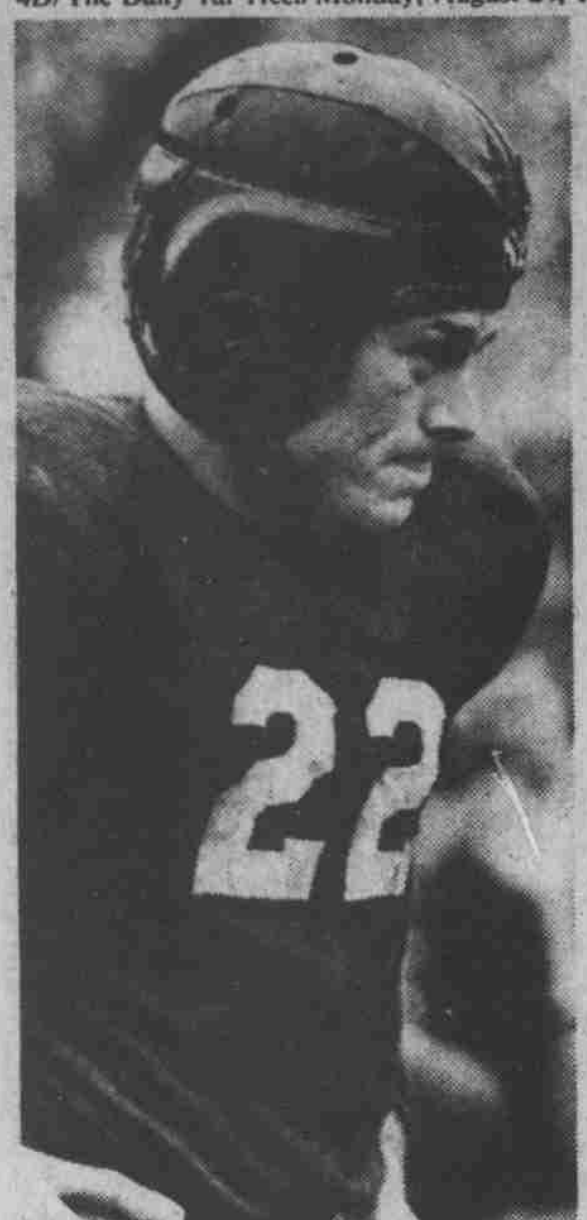
Answer to No. 2