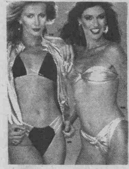
"Bathing Suits to be worn away from mom!"