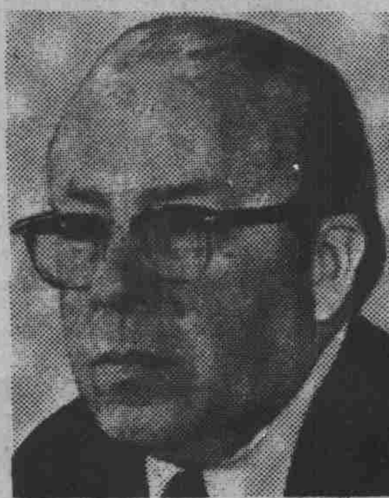
George P. Shultz

national Atomic Energy Agency Conference following the conference's vote to deny Israel credentials in response to the massacre. Shultz said the United States is holding up payments to the IAEA pending an assessment of U.S. participation. State Department officials said the amount suspended is $8.5 million for this year. In Jerusalem, a senior official said the U.S. support was mentioned by several ministers during a Cabinet meeting, but no further details were reported. Israeli newspaper editorials welcomed the U.S. stand, but warned the government not to misinterpret Washington's gestures or take the support for granted. The mass-circulation Maariv , noting what it called improving relations between Jerusalem and Washington, urged the government to soften its accusations against the American government "and return to the line of dialogue." It was referring to charges raised here that the Reagan administration was trying to bring down Prime Minister Menachem Begin's government following the massacre of Palestinian refugees. The independent Jerusalem Post said U.S. support not only protects Israeli interests but also helps "contain domestic lunacy" in the form of attacks on Washington by Israeli rightists. If the Reagan administration were to withdraw funds from the U.N., it would be acting in accordance with resolutions passed this spring by the House and