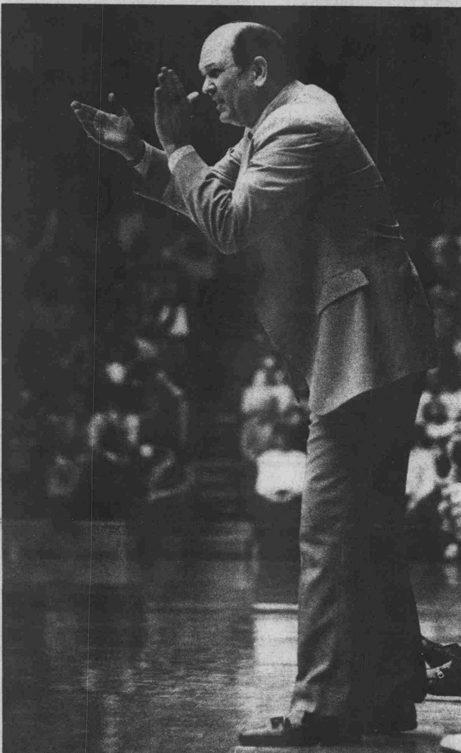
Lefty Driesell cheers his Terps in their loss to the Tar Heels in Carmichael ... Driesell and Maryland got revenge last night and thrashed the Heels, 106-94

"That was by far the worst beating we've taken all year," UNC coach Dean Smith said. "Maryland deserved to win — they out hustled us and outquicked us."