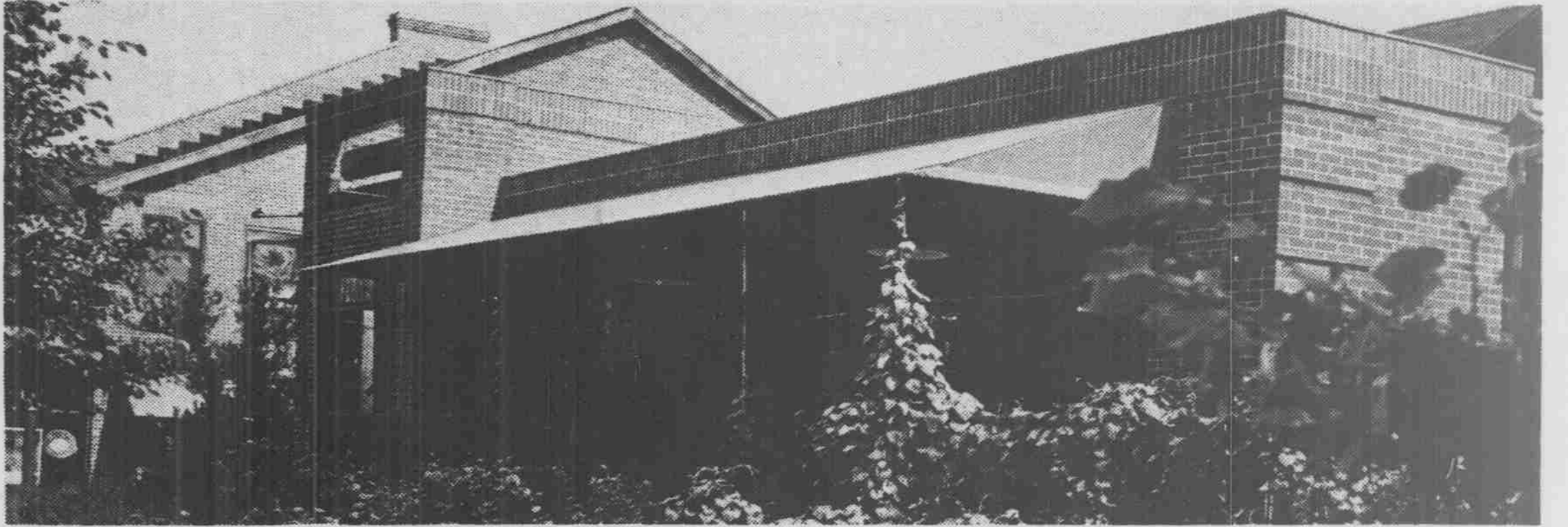
Pewacket in the Courtyard.

Please support the AMERICAN CANCER SOCIETY