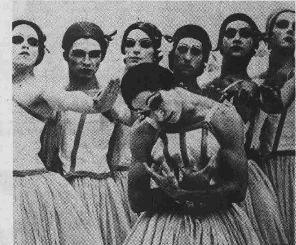
Members of Les Ballets Trockadero de Monte Carlo, an all-male dance troupe that spoofs classical ballet, pose for a scene from 'Giselle.' The group plays Memorial Hall Monday at 8 p.m.