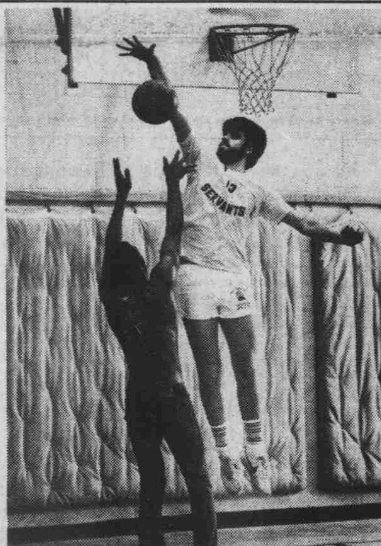
UNC student goes one-on-one with a youth at Dillon School — a part of program therapy.