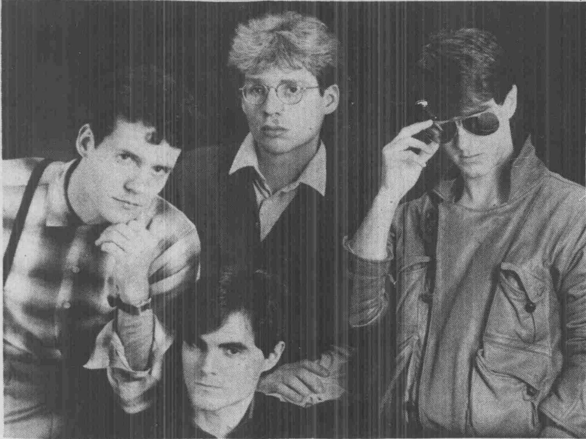
Rock group Glass Moon, with distinctive American-British sound, performs tonight at Rhythm Alley