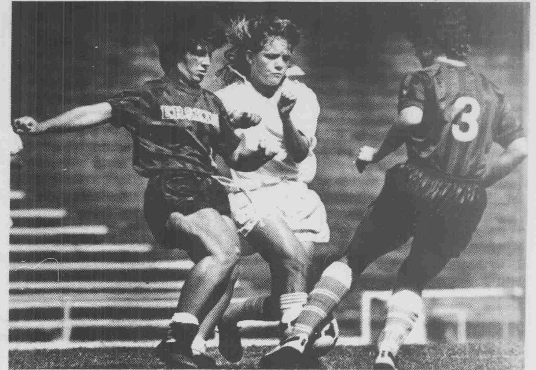
It took only one half and six UNC goals to decide Tuesday's outcome.

Coach Anson Dorrance restricted his team to just scoring on head-balls off