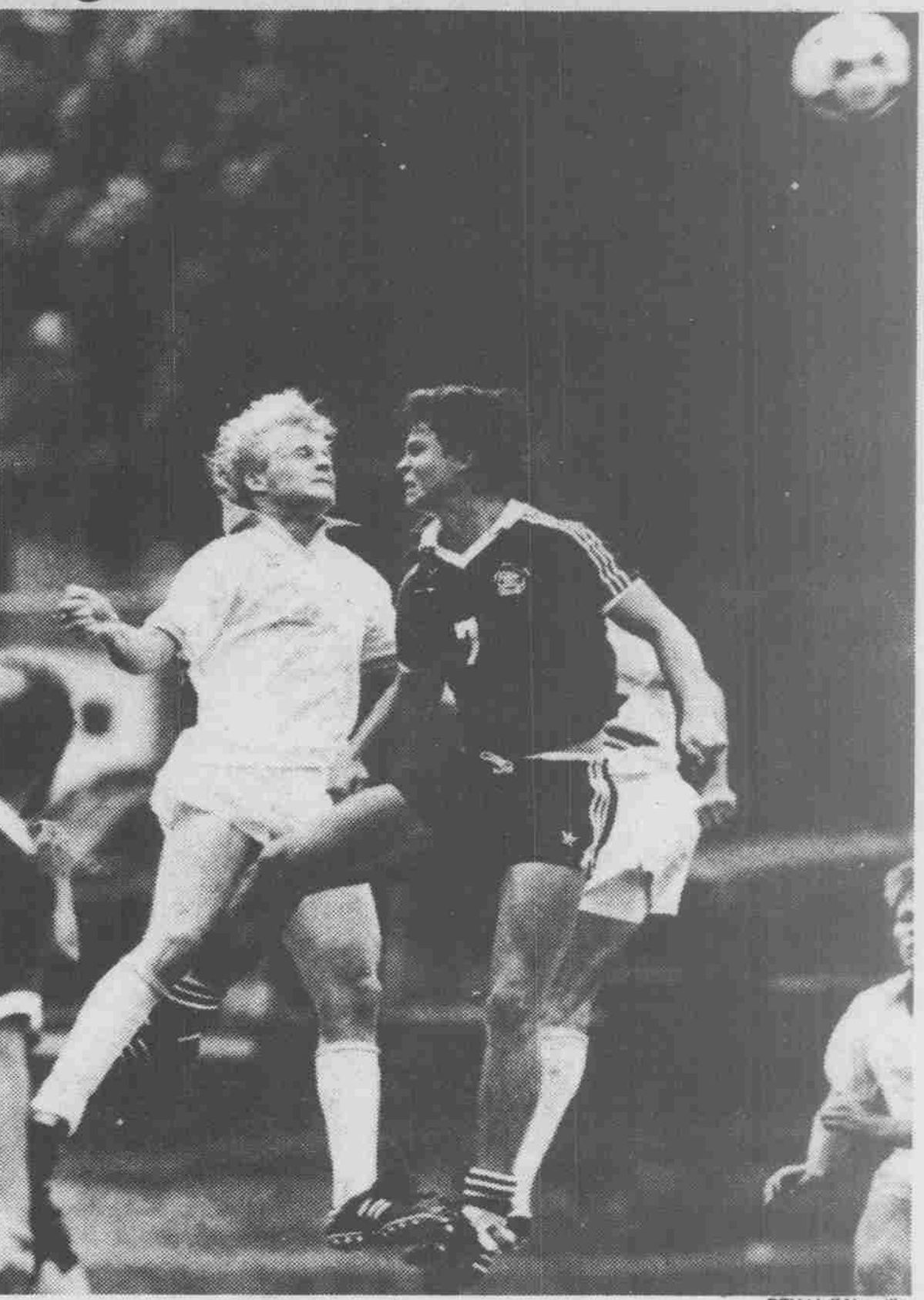
Confrontation: UNC knocked Duke out of the NCAAs with its 1-0 win