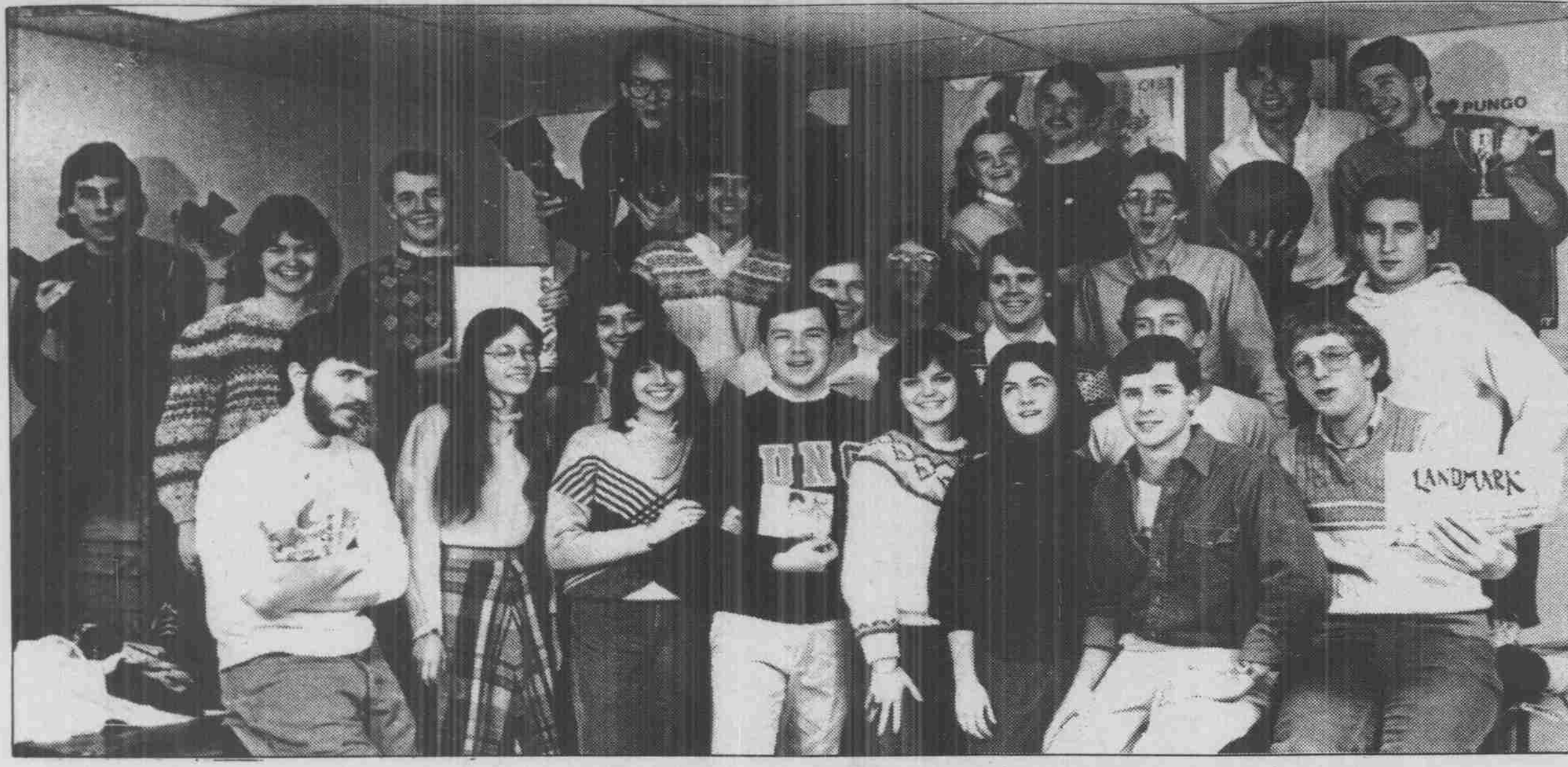
Some members of the 1984-85 Daily Tar Heel staff display their comradery, athletic prowess and journalistic wit in this rare photo.

You don't have to go to Washington to read a great newspaper