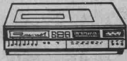
Fisher VCR Only $29.95/mo.