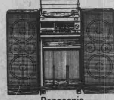
Panasonic Component Stereo System $26.95/mo.