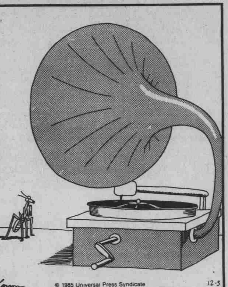
© 1985 Universal Press Syndicate 12-3