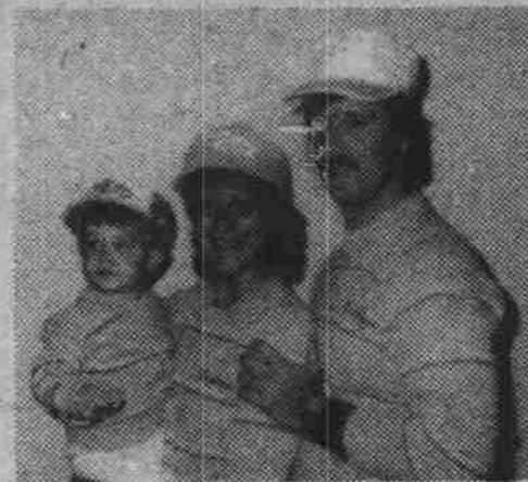
Carolina Sweaters light blue with navy and white stripes.