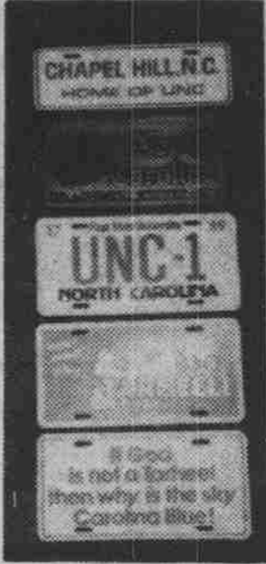
Carolina License Tags. All metal tags $3, pewter tag $15.95