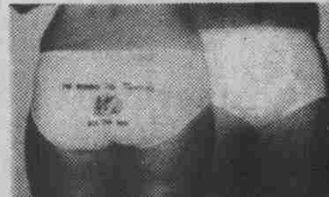
She is modeling Carolina pants. He's modeling Carolina Ram men's shorts.