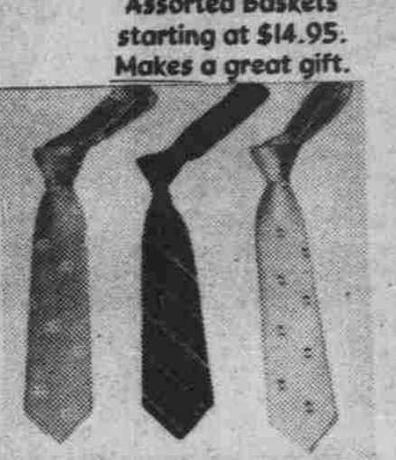
Carolina Ties $9.95. Navy or light blue.