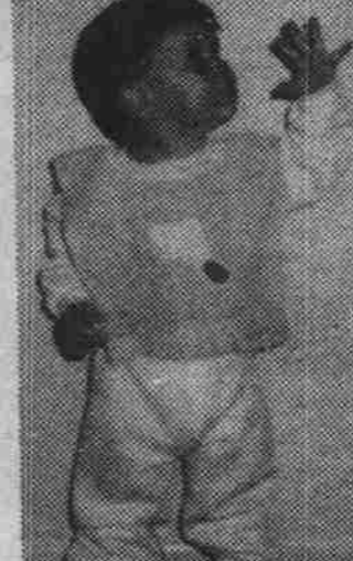
Chad's Terrycloth Carolina bib is $7.95. Personalized name printed free.