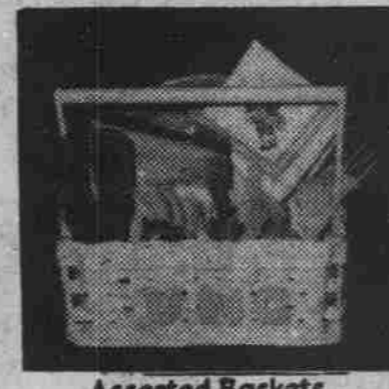
Assorted Baskets starting at $14.95. Makes a great gift.