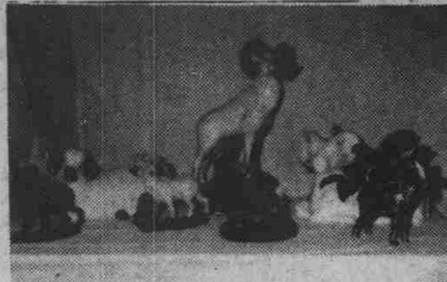
Rams for the office, home or any occasion. $12.95 - $39.95