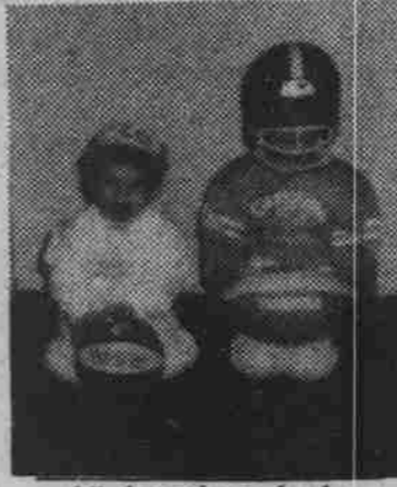
All-American Andy wears a Carolina uniform $32.50 Football $12.95 All-American Chad wears a sweat suit at $13.95 Mini Basketball $8.95