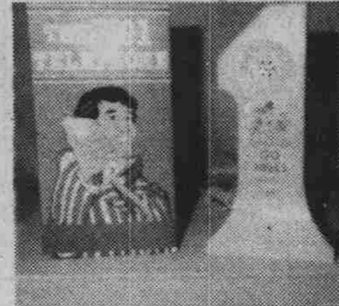
Carolina #1 telephone $34.95. Rings like a ref's whistle.