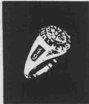
Silk N' Satin