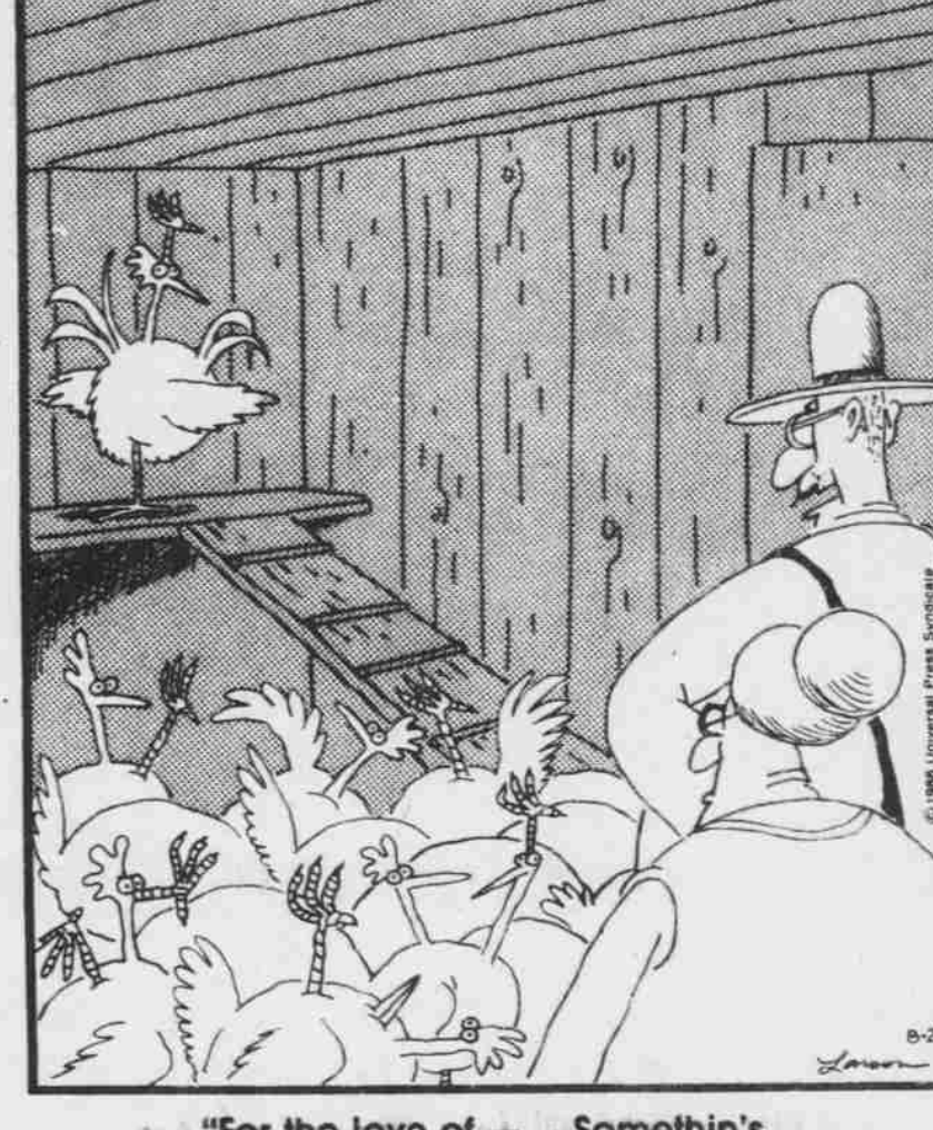
"For the love of - ... Somethin's been messin' with these chickens!"