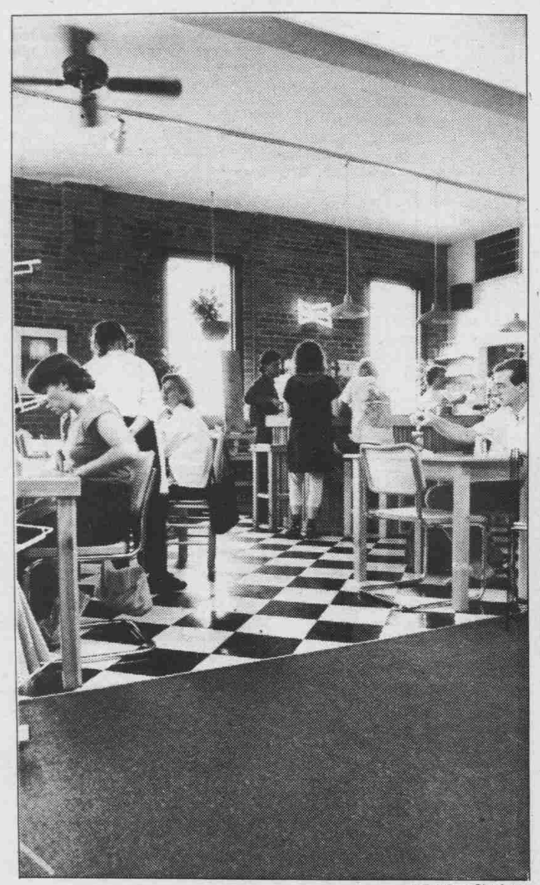
Hardback Cafe has literary atmosphere