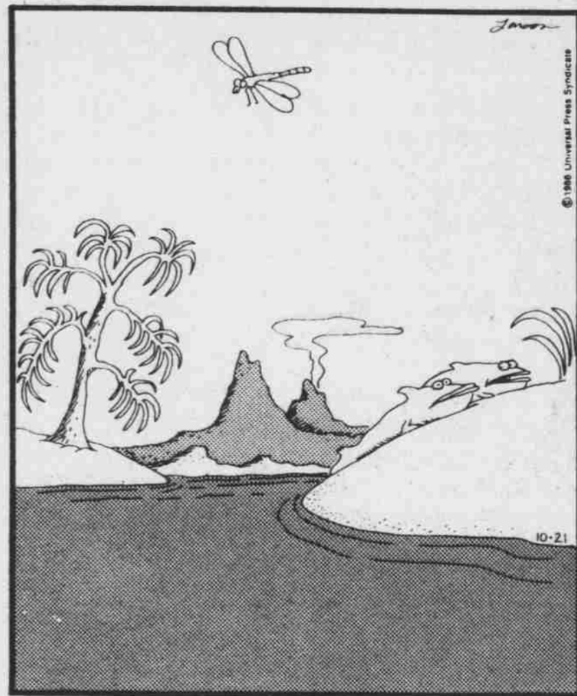
"Again? What is it with you that as soon as you put one fin on the land you have to go?"