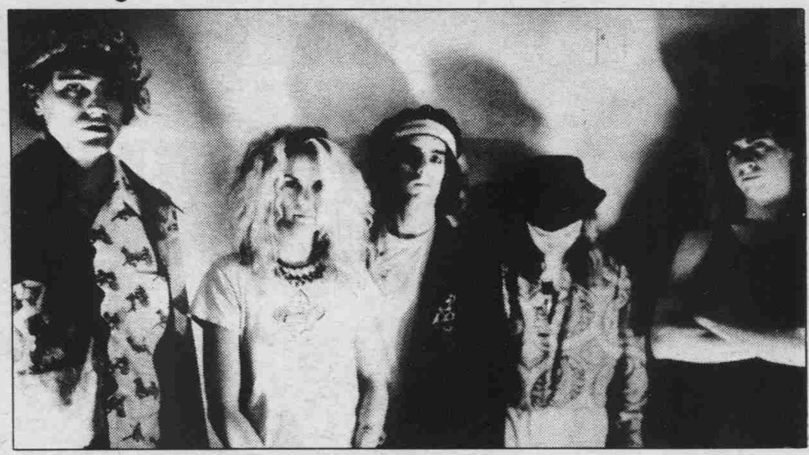
Fetchin Bones will perform at Cat's Cradle on Friday