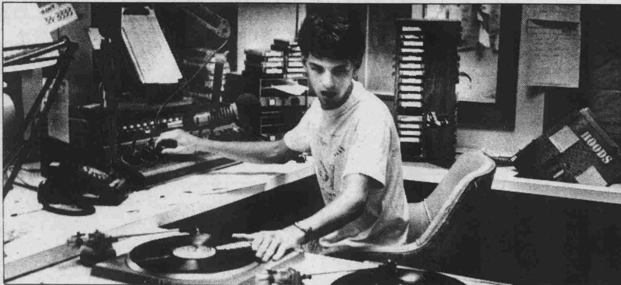
A WXYC DJ spins the tunes during his shift