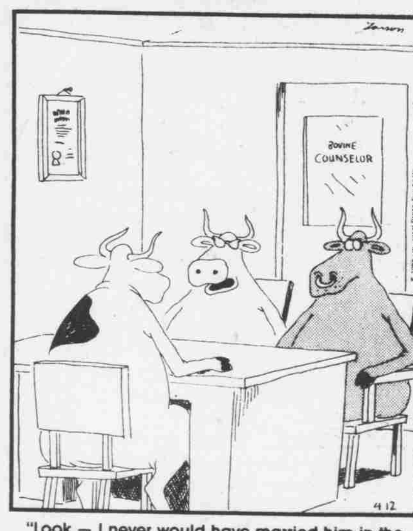
"Look — I never would have married him in the first place, but the jerk used a cattle prod."