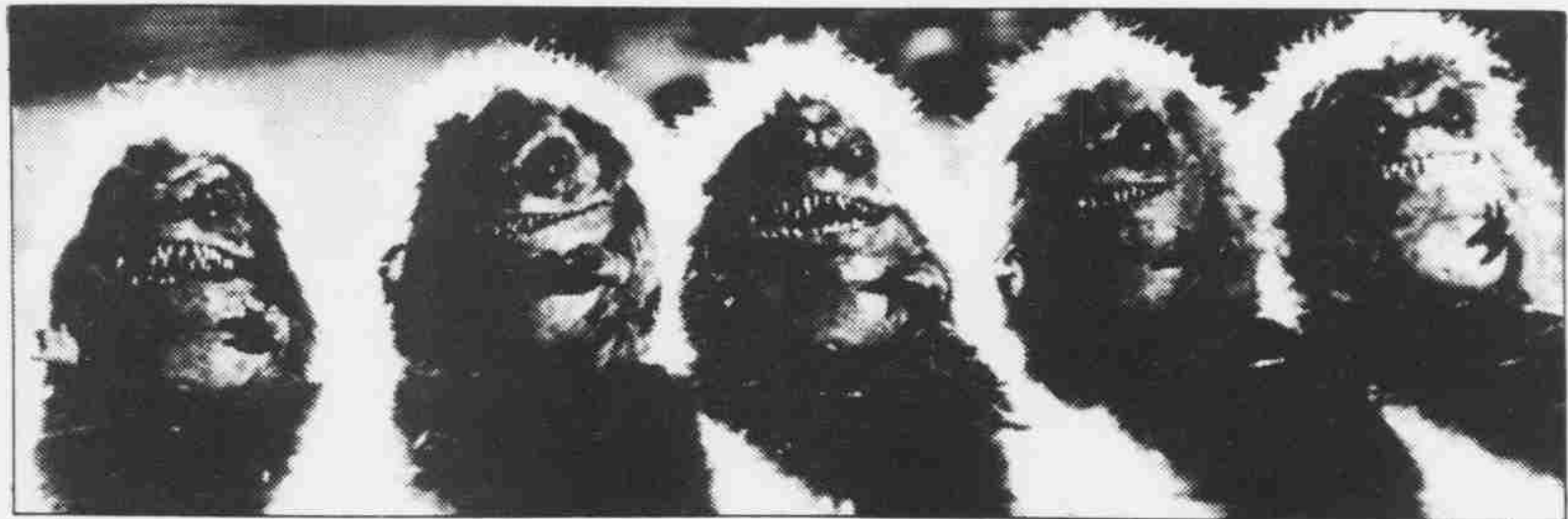
In the title role of "Critters 2" are these toothy porcupine tumbleweeds