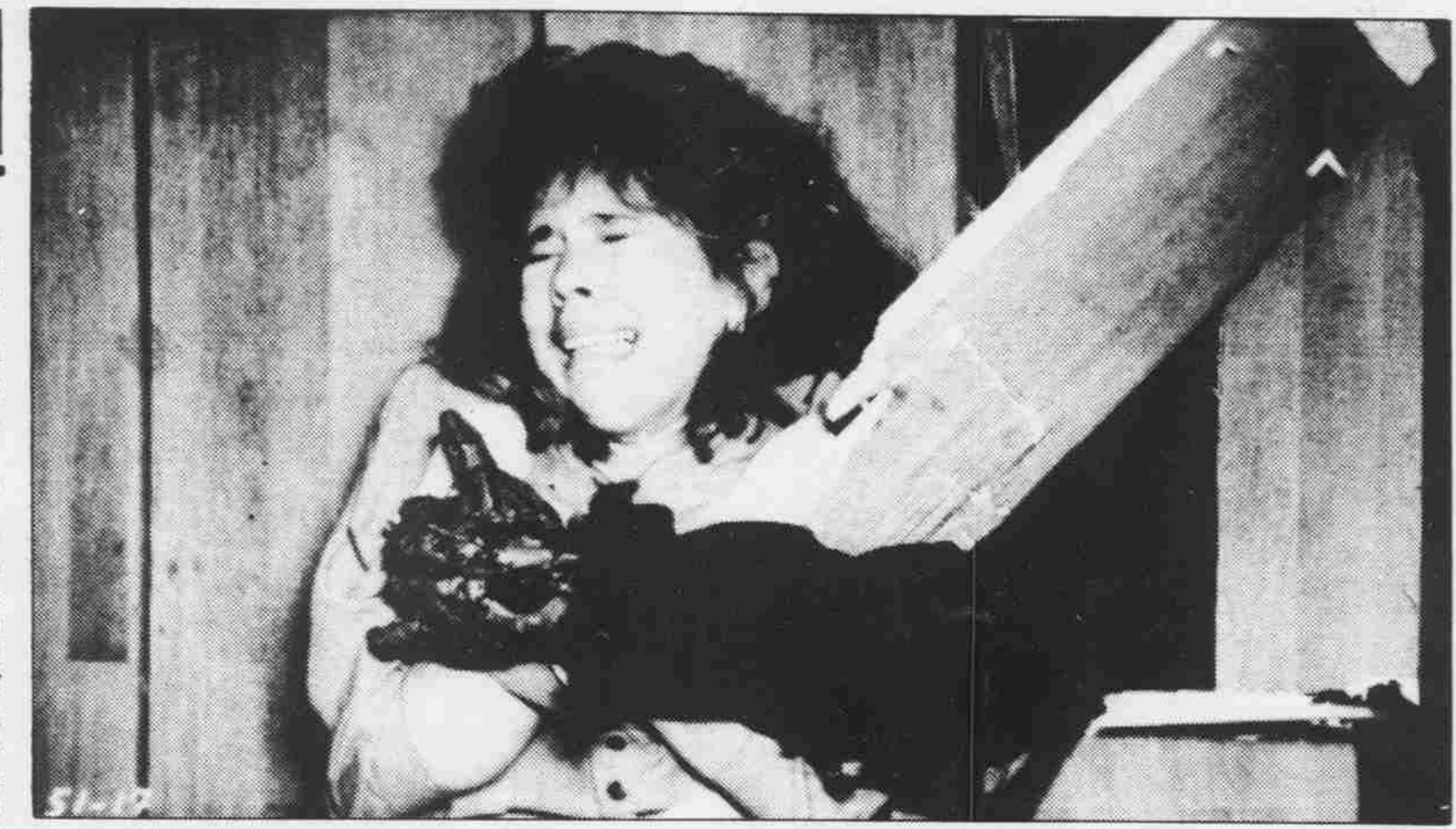
We don't want to spoil the suspense in this scene from "Friday the 13th Part VII," and so MAYBE Jason will take pity on this girl

I assume you see what's developing here. We got us a Jason-Buster. Jason out of line? Wham! Drop a telephone pole on him. Jason hacking off too many people? Kaplooey! Levitate a