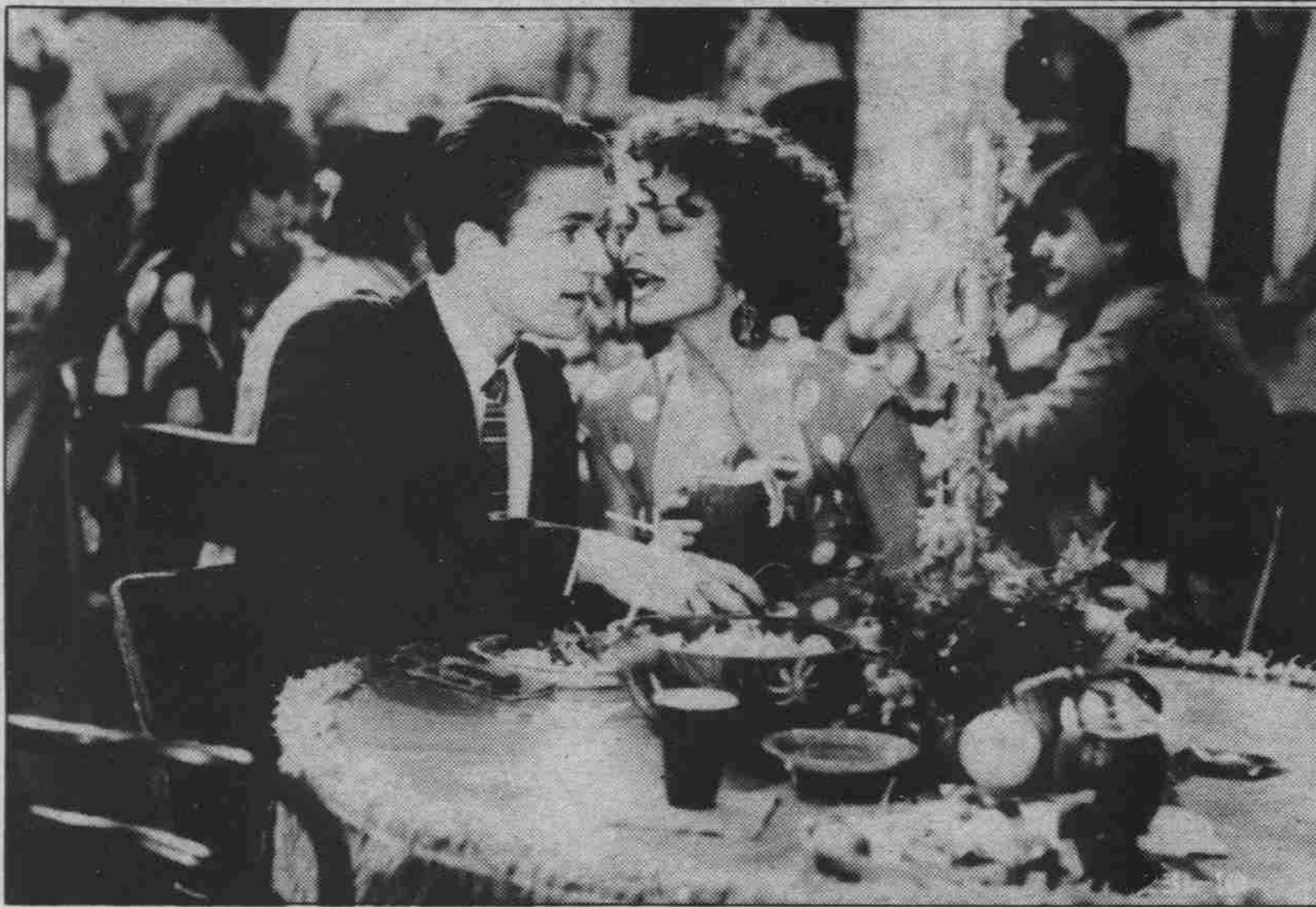
Jonathan Demme's "Married to the Mob" scores high marks with on-screen lovers Matthew Modine and Michelle Pfeiffer.

realistic depiction of an drug and alcohol addict going through a rehabilitation program.