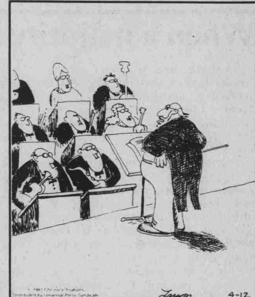
"I don't know which one of you is doing it, but at the end of the symphony, we shall refrain from playing 'shave and a haircut.'"