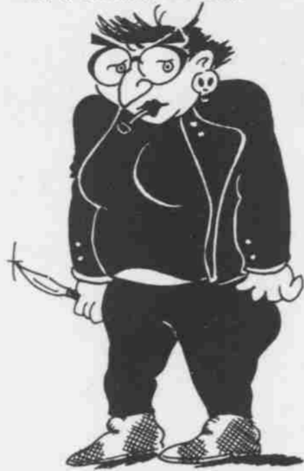
Honey's fat roommate. She's so tough, she wears spiked leather undergarments. INSIDE OUT.