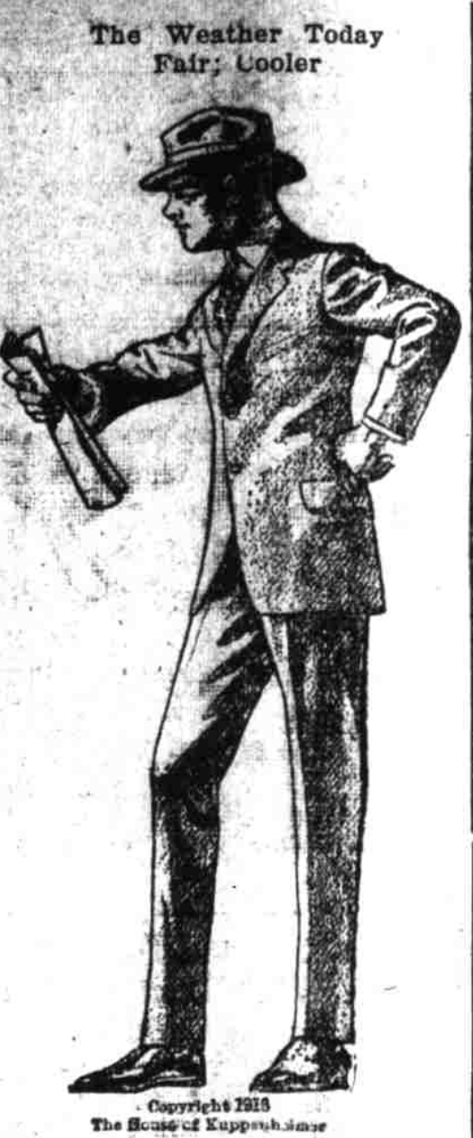
The Weather Today Fair; Cooler

The cash road and bridge expenditures of the United States averaged only $28 per mile of rural roads in 1904. In 1915 this average had grown to $109 per mile.