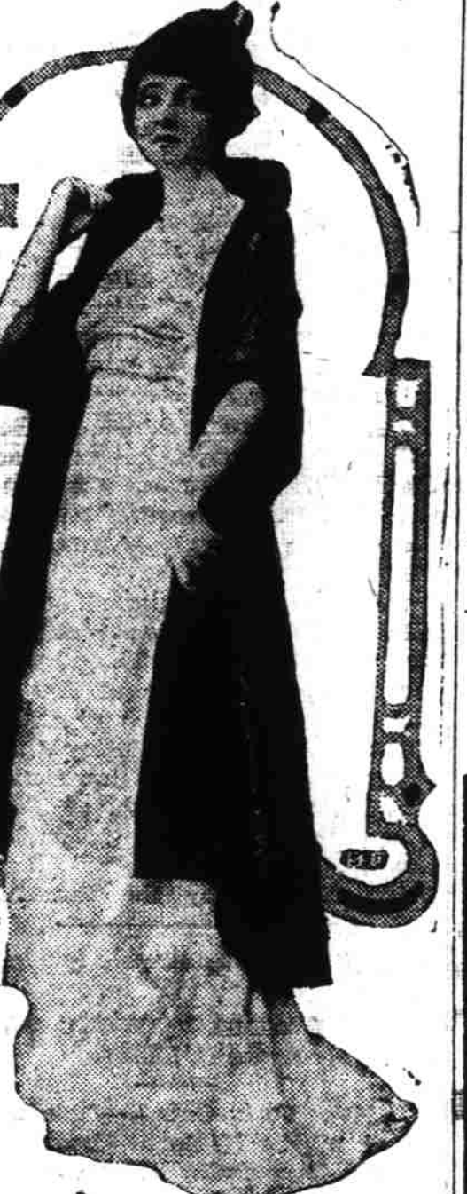
Marie Doro, Lasky Star in Paramount Pictures.

Fifty-Fifty. (London Opinion.) In Cornwall there was a case involving the ownership of an eight-day clock. After listening to the testimony the judge said to the plaintiff, "You get the clock."