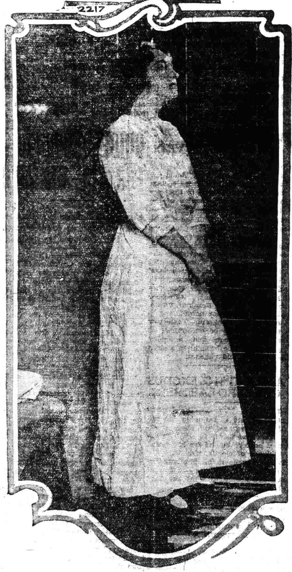
PAULINE FREDERICK The Superb Emotional Artist in "Ashes of Embers," Her Latest Paramount Feature, at the Grand Thursday

PAULINE FREDERICK. Some time ago Pauline Frederick, the celebrated emotional star, declared that she wanted to play a sympathetic role and was starred by the Famous Players Film Company in an adaptation of Clyde Fitch's "The Woman in the Case" in which she scored a great personal success. Now the great Famous Player star has another still more wonderful opportunity of displaying her remarkable skill and versatility for in that company's production "Ashes of Embers," which is the Paramount picture at the Grand this week, the beautiful emotional actress who made "Zaza" and "Bella Donna" live on the screen, appears in the dual role of twin sisters who are absolutely opposite in character. The one, Agnes, is a sweet-faced self-sacrificing drudge. The other, Laura, is totally without conscience and so utterly selfish that she even steals from the department store cash drawer of which Agnes has charge in order to get money for a dress. As a result of this theft Agnes is sent to jail where she is completely forgotten by Laura, who has used the dress in-