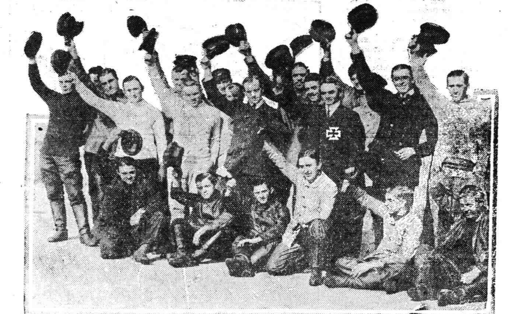
CREW OF DEUTSCHLAND. These are the intrepid seafarers who guided the German submarine merchantman Deutschland twice across the Atlantic ocean in the face of the British blockade.