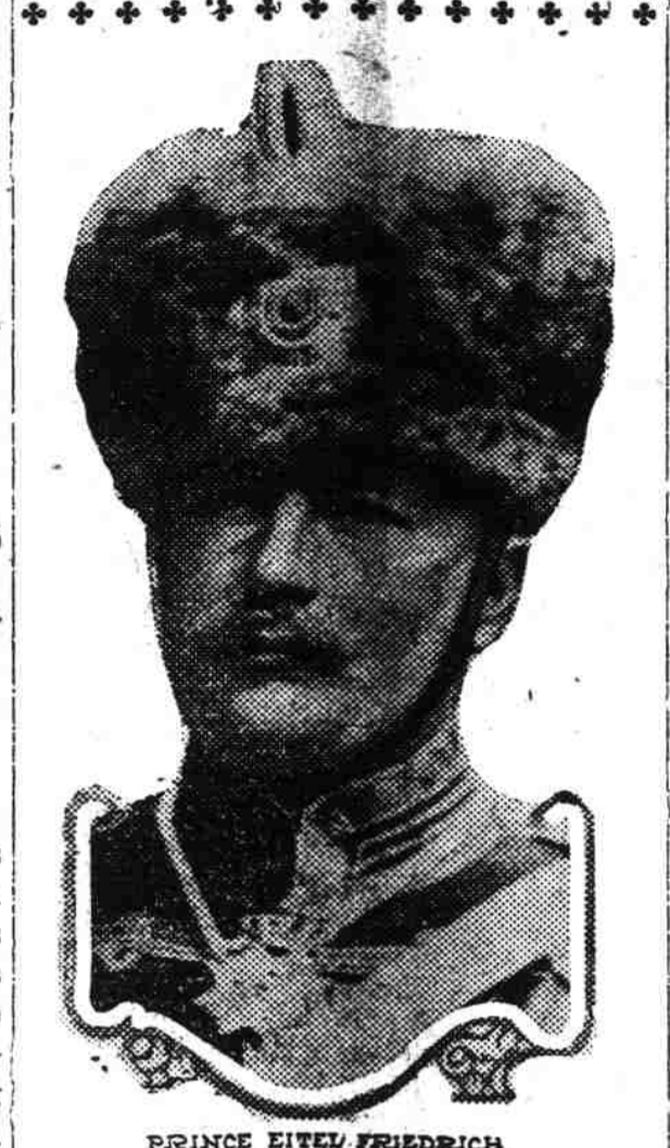
PRINCE EITEL FRIEDRICH