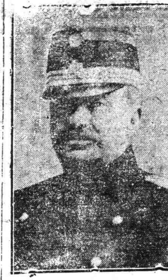
Geneva—General Willie, Chief of the Swiss Army, replying today to a demand by agriculturists of the Canton of Zurich to postpone mobilization of troops of the canton, refused on military grounds.

***** "Owing to the entrance of America into the war," he said "possibilities of the war taking a new and perhaps last phase next spring are greatly increased. Therefore, the danger for us of being drawn into the conflict will be greater than ever." *****