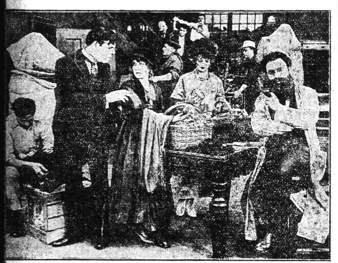
Scene from "Even As You and I" at the Grand Today and Tomorrow.