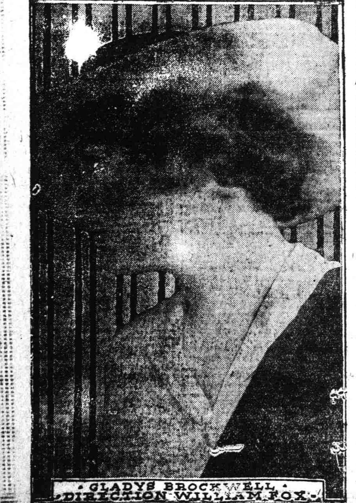
GLADYS BROCKWELL. DIRECTION WILLIAM FOX.