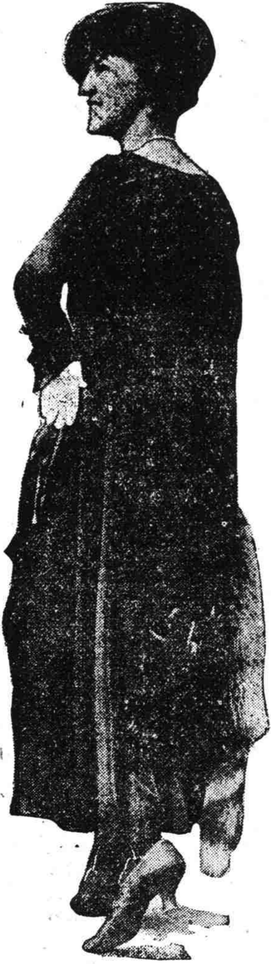
LATEST FASHION HINT—For early fall wear, rumor has it that black satin will be very popular. This snug fitting bodice and peg top skirt could be made to see one through from breakfast to dinner. Beads suggestive of the Northern Indian compose the grille.