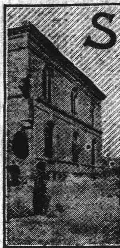
SHELL HOLES IN PORT ARTHUR BANK.

SOME idea of what a shell does to a modern building may be gained from the accompanying picture of one corner of the Russo-Chinese bank in Port Arthur. During the siege the bank was struck twice in the same corner by Japanese projectiles, and the larger of the two apertures made in the brick wall was seven feet high by about five feet broad. During the siege the hospitals were struck repeatedly, and a number of sick and wounded men were killed in their cots. The Japanese declared that bombarding hospitals was not their intention, but that after their big guns had been fired many times their accuracy was impaired and the offending shells fell short of the real marks aimed at. Many of Port Arthur's noncombatants lived in caves, but even here the shells at times searched them out and killed them.