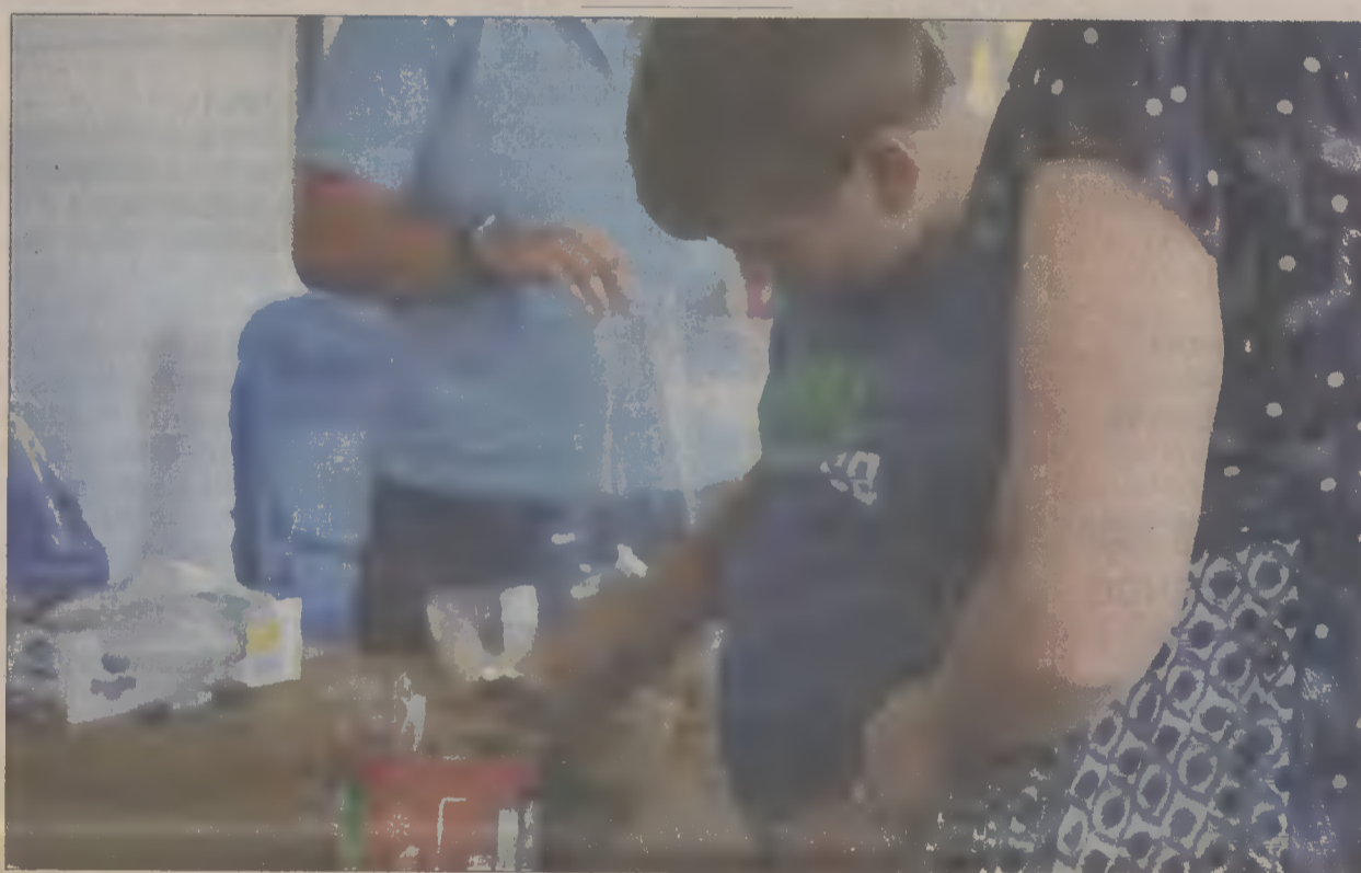
The Roanoke River National Wildlife Refuge, the Roanoke Cashie River Center and the Town of Windsor hosted a Hunting, Fishing and Wildlife Day last Saturday, Sept. 22 for children of all ages at the Roanoke Cashie River Center in