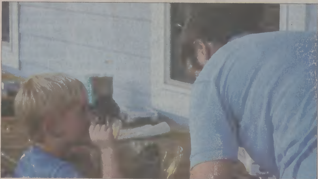
Windsor. There was archery, airsoft rifles, fish casting, boat rides, kayaking and arts and crafts. The Cashie Beekeepers Association held demonstrations for Honeybee Awareness Day.